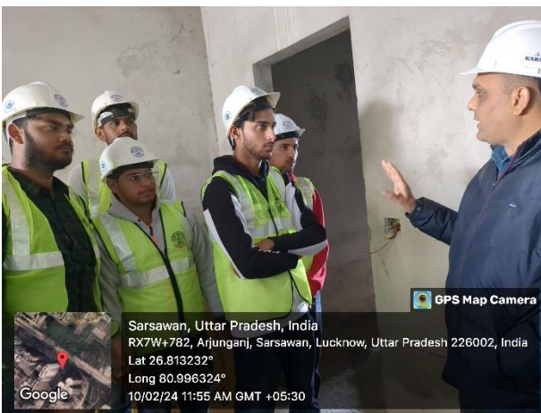
Wall plaster work