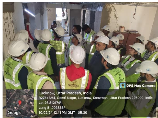
Ceiling plaster work