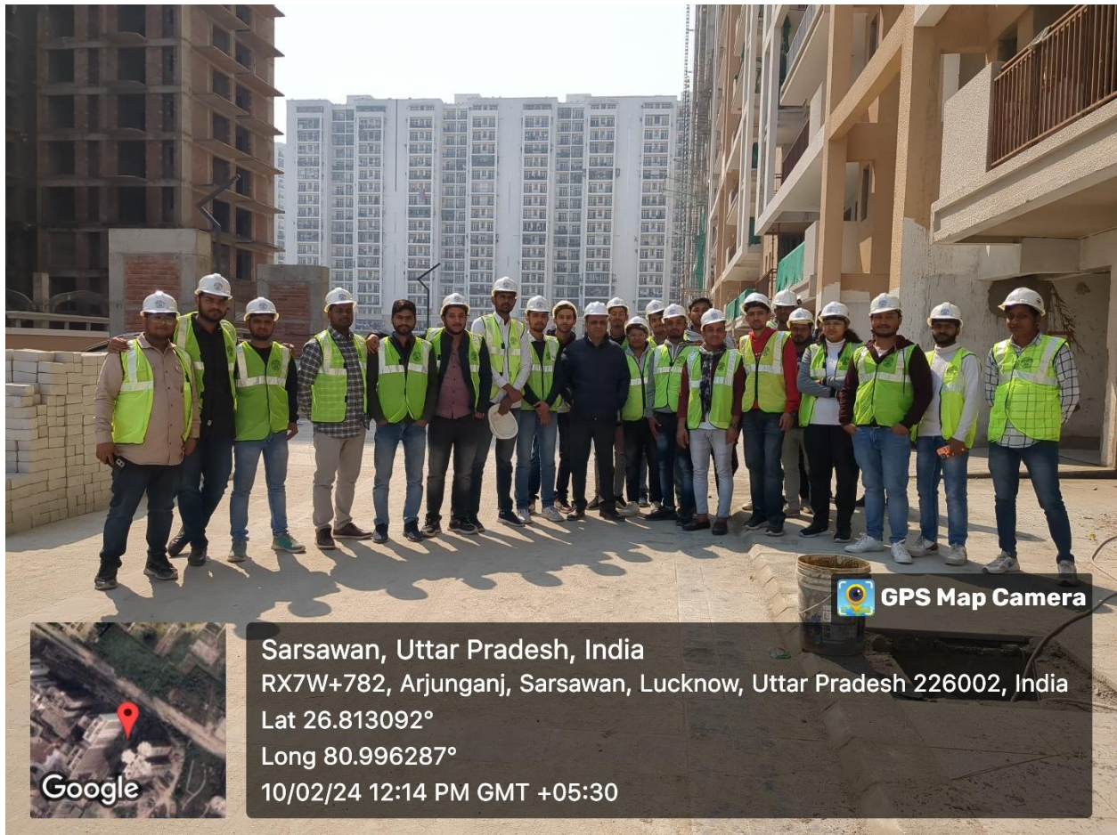
Group photograph at M/s Rishita Manhattan, Shaheed Path, Lucknow